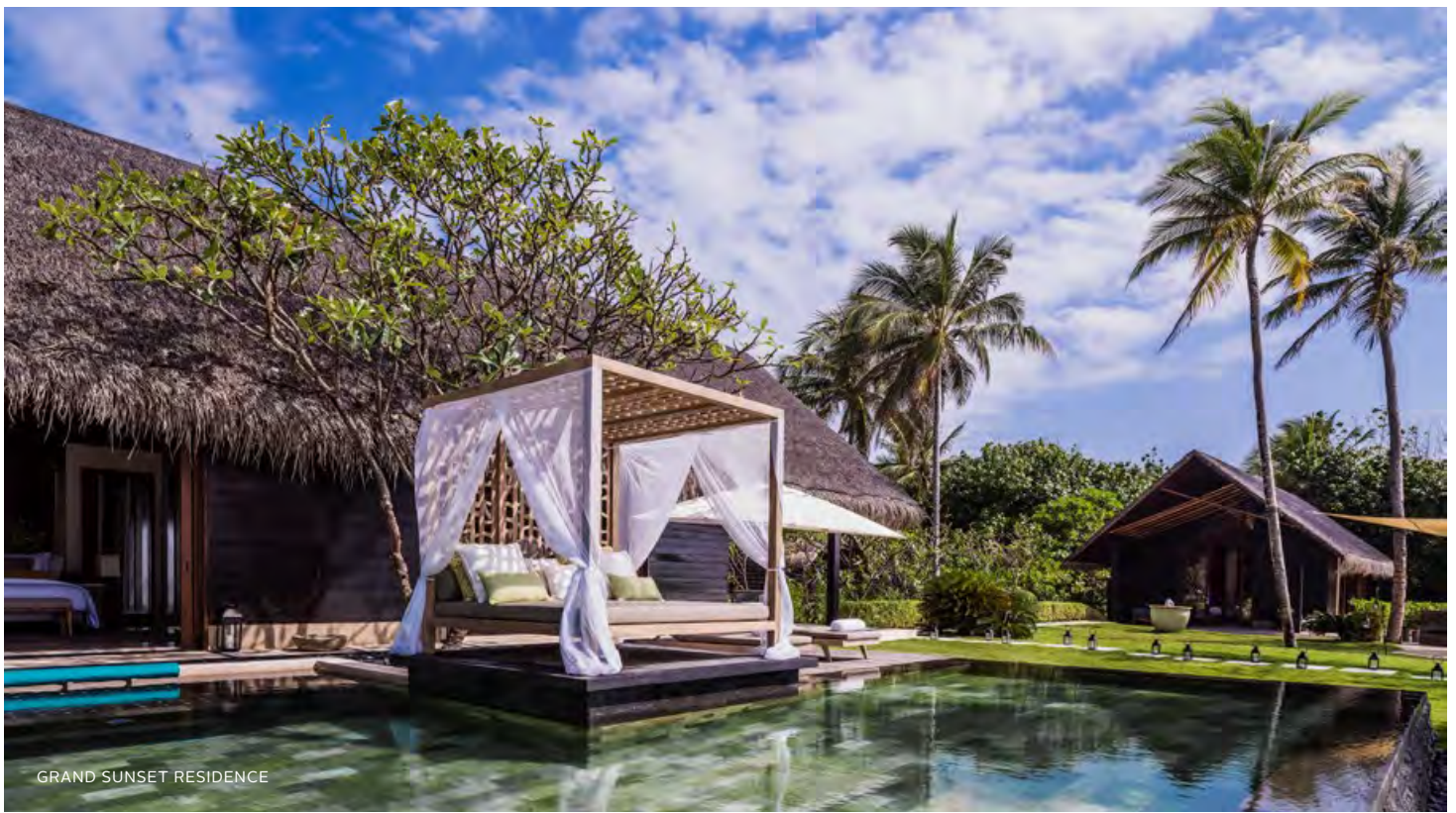
GRAND SUNSET RESIDENCE