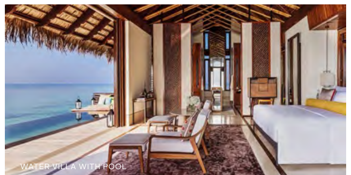
WATER VILLA WITH POOL