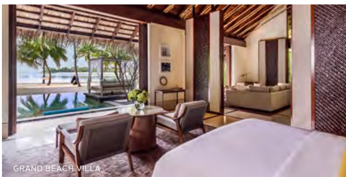
GRAND BEACH VILLA