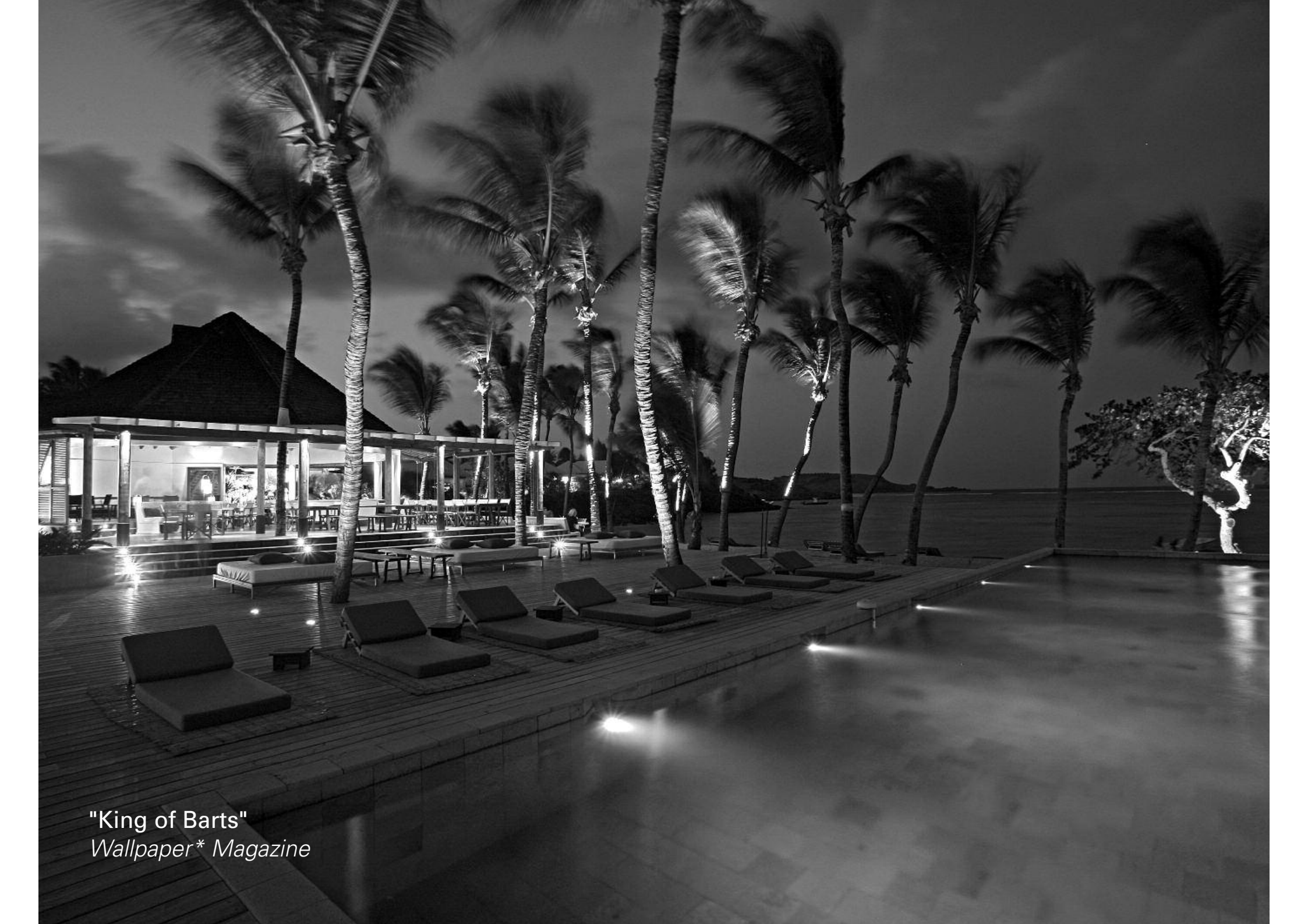
"King of Barts" Wallpaper* Magazine