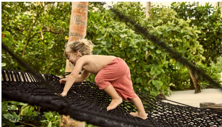
Play by COMO