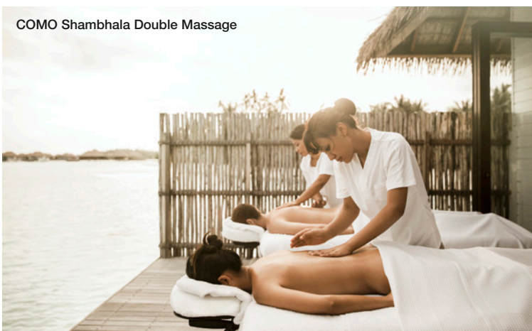
COMO Shambhala Double Massage