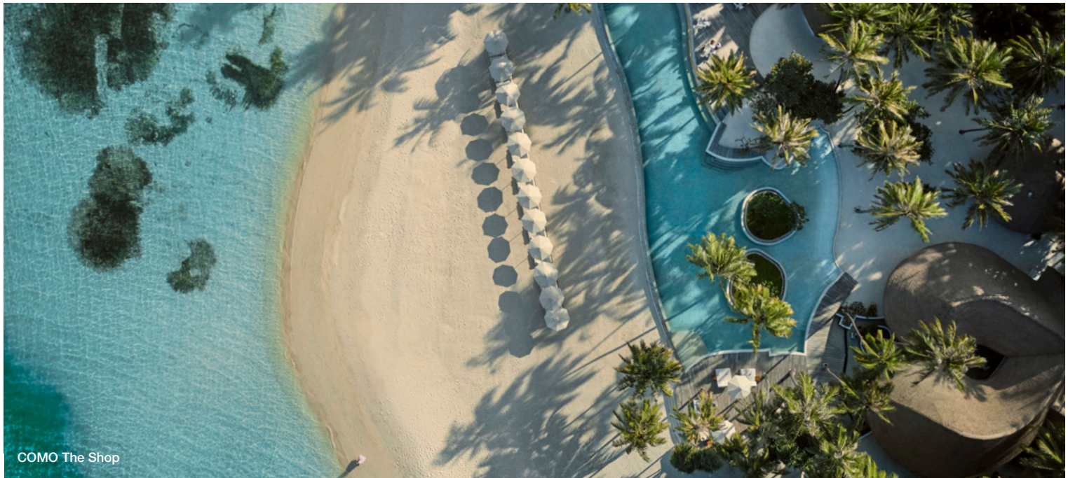
COMO The Shop