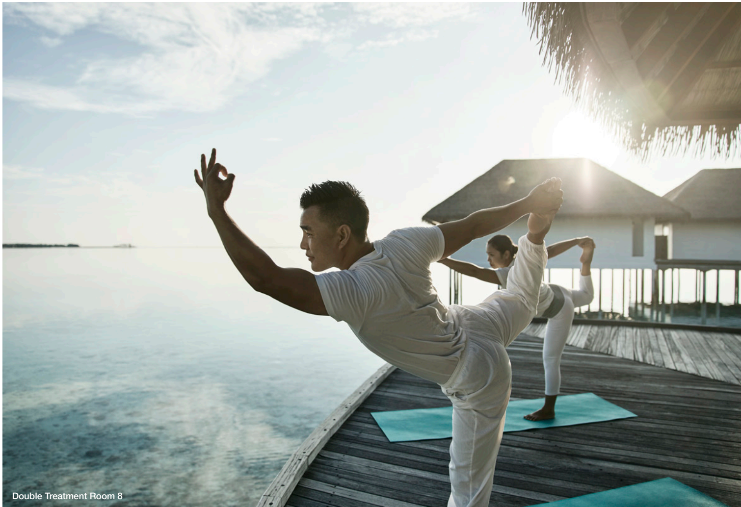
Double Treatment Room 8