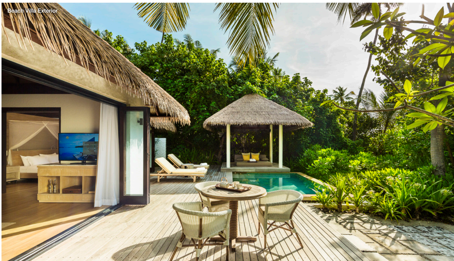
Beach Villa Exterior