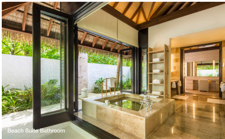
Beach Suite Bathroom