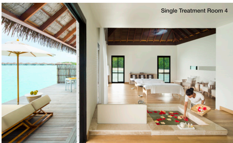
Single Treatment Room 4