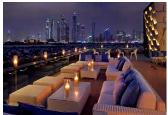
101 Dining Lounge and Bar

The chic, overwater 101 Dining Lounge and Bar brings a sophisticated vibe to the resort's exclusive island-feel atmosphere. Under sweeping white canopies, alfresco dining opens onto a fashionable chill-out lounge with seaside tables and bar.