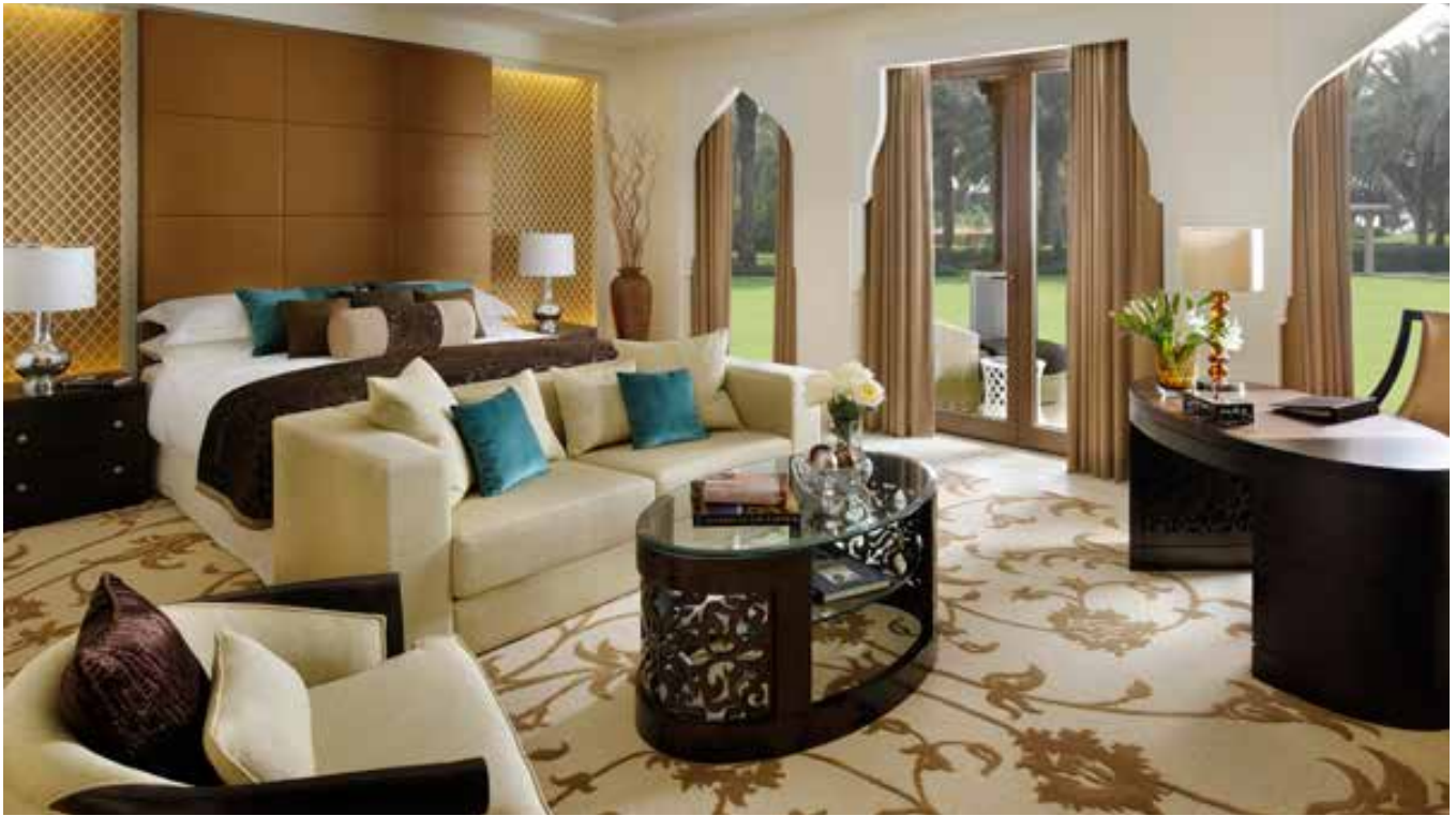
Manor House Premiere Room