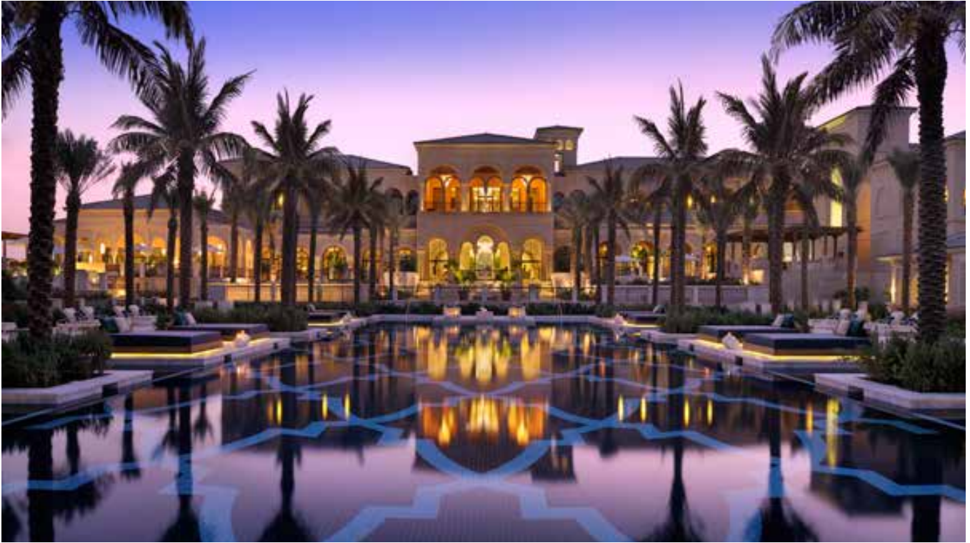
Manor House and Pool