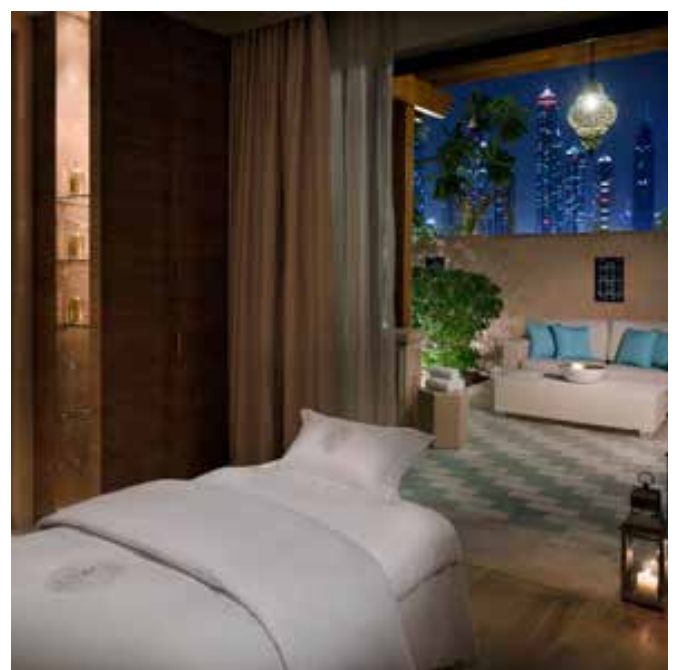
Guerlain Spa Treatment Suite

With sublime perfection, Guerlain Spa offers rejuvenating treatments in nine private suites surrounding a central courtyard and private lap pool. Wellness facilities include a state-of-the-art Fitness Centre with Kinesis training stations, tennis court, Bastien Gonzalez Pedi:Mani:Cure Studio and pampering hair salon.