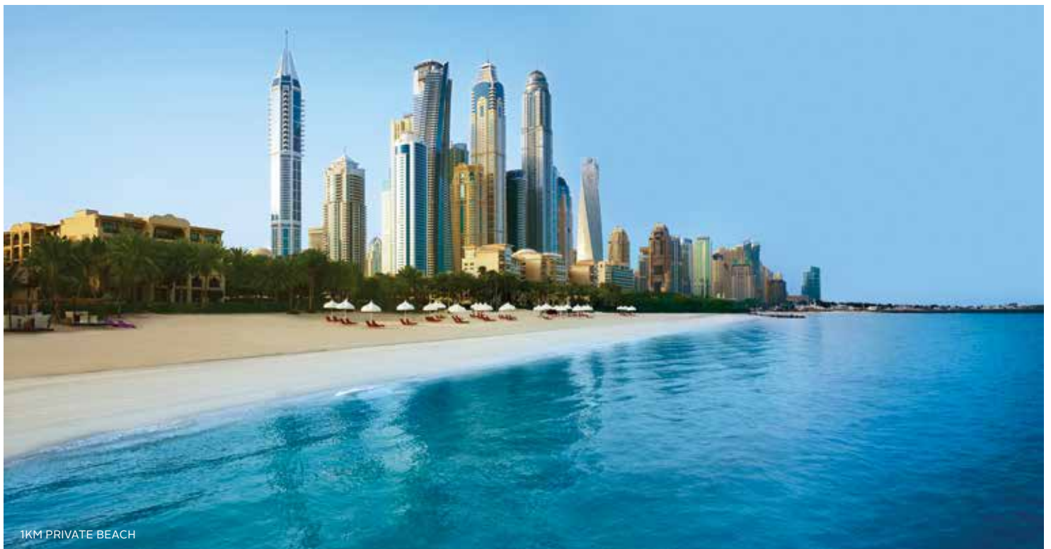
1KM PRIVATE BEACH