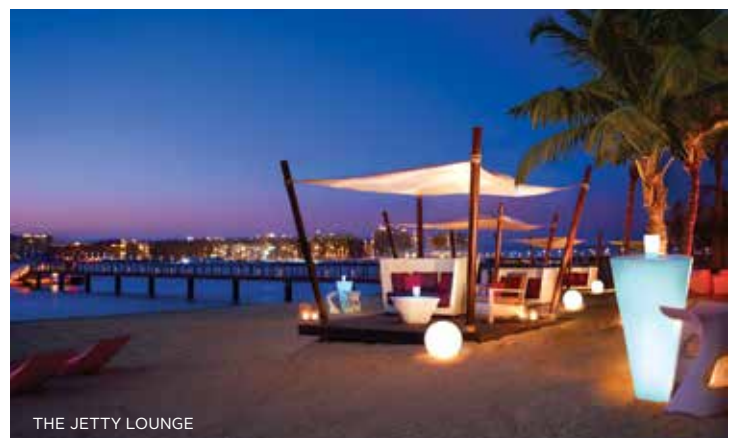
THE JETTY LOUNGE