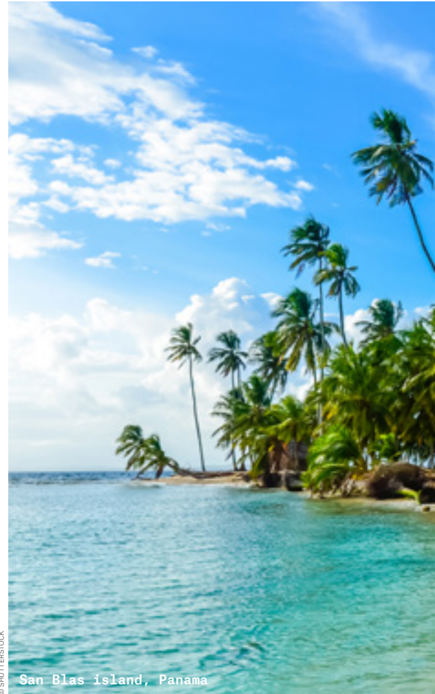
San Blas island, Panama

This map describes our planned journey. Weather conditions will determine our final itinerary.