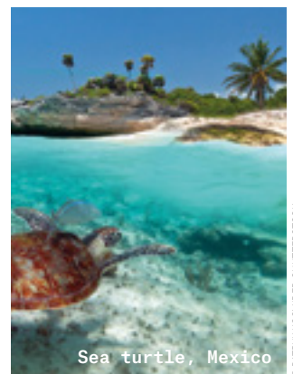
Sea turtle, Mexico

Our final call is Bridgetown, the capital of Barbados. See the original Trafalgar Square and take in the 17th century British colonial architecture. Make the most of Caribbean beach life, and sample Caribbean food - a fusion of African, Creole and Cajun flavours.