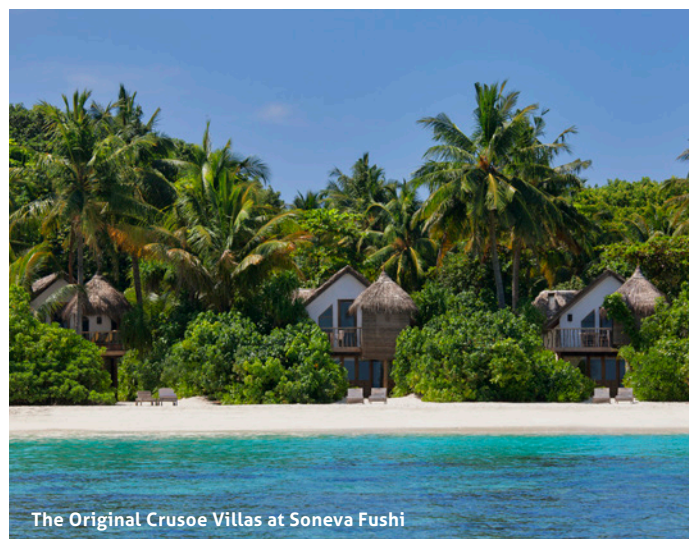
The Original Crusoe Villas at Soneva Fushi