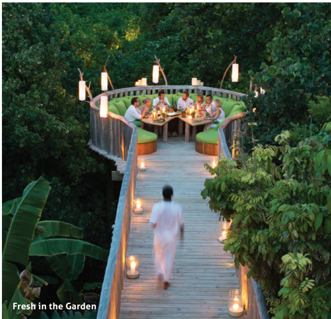
Fresh in the Garden

Perched high above dense tropical banana trees and the resort's organic gardens below, this restaurant offers delicious modern Mediterranean dishes in the open kitchen using freshly picked produce from the organic garden.