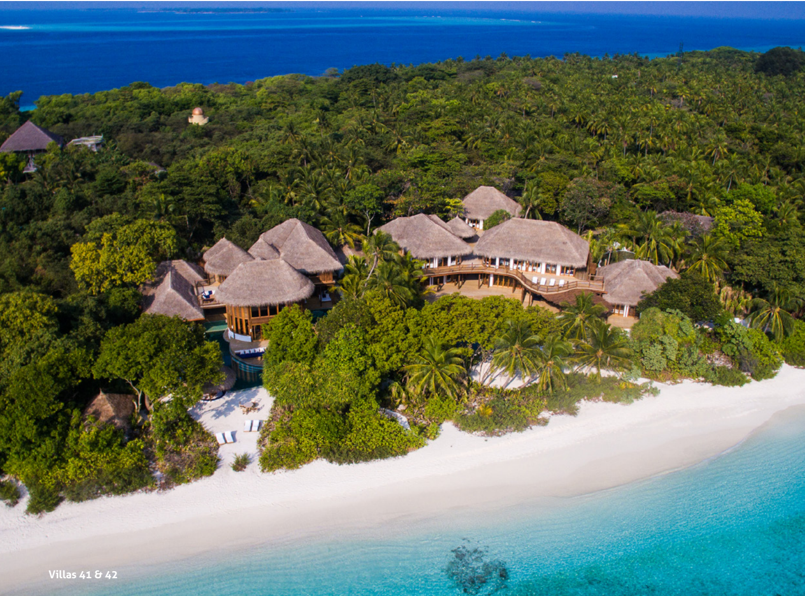
Villas 41 & 42