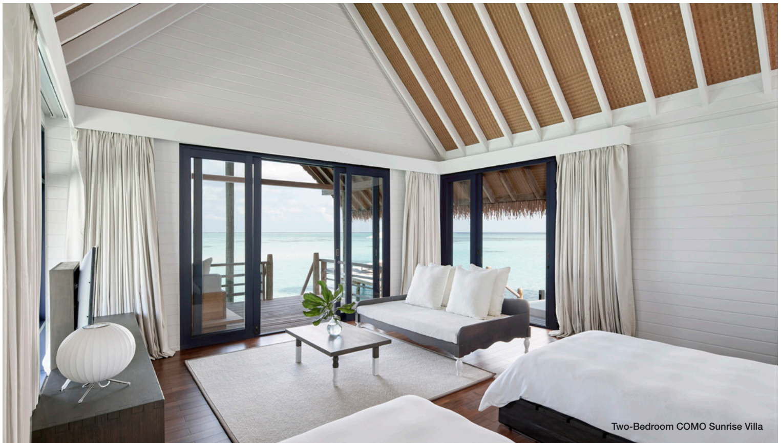
Two-Bedroom COMO Sunrise Villa