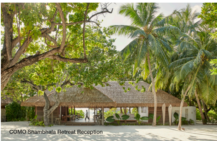
COMO Shambhala Retreat Reception