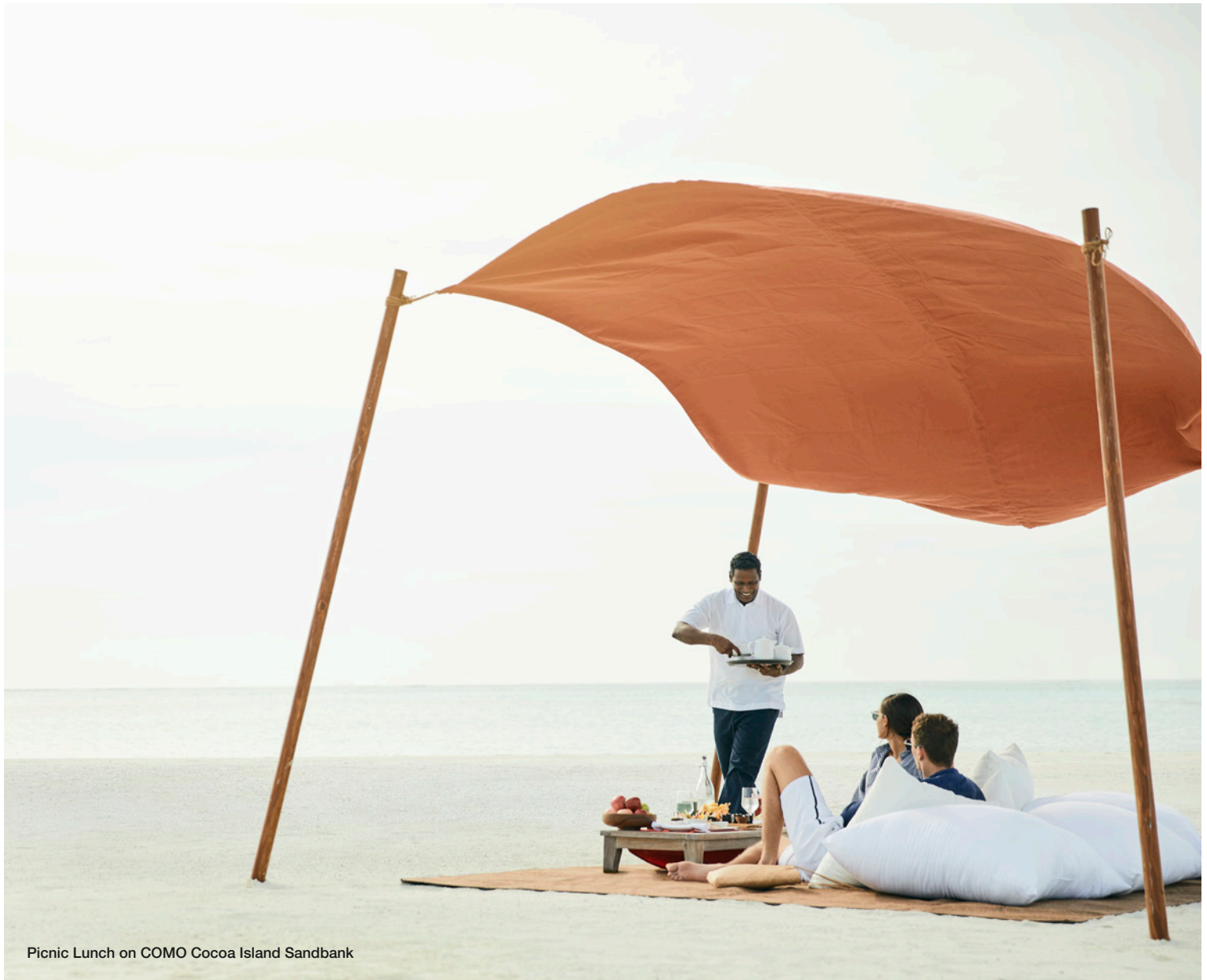
Picnic Lunch on COMO Cocoa Island Sandbank