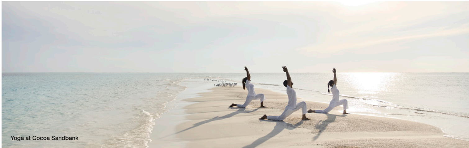
Yoga at Cocoa Sandbank